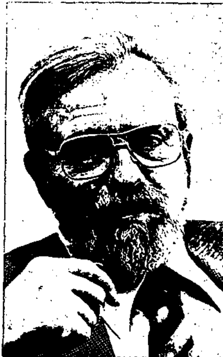
J. Allen Hynek, PhD, Scientific Director of CUFOS