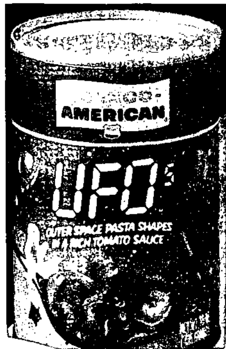
UFOs as "Pop Culture"

Letters to the Editor are invited, commenting on any articles or other material published in the Journal. Please confine them to about 400 words. Articles of about 500-700 words will be considered for publication as "Comments" or "Notes." All submissions are subject to editing for length and style. Please type and double-space all articles.